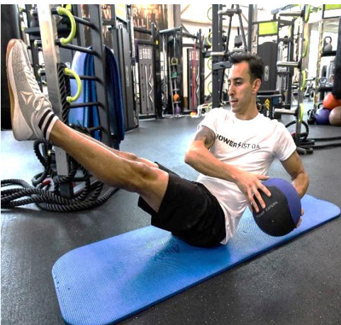
5-MB Russian Twists mit gest. Knien: 30 Sekunden.